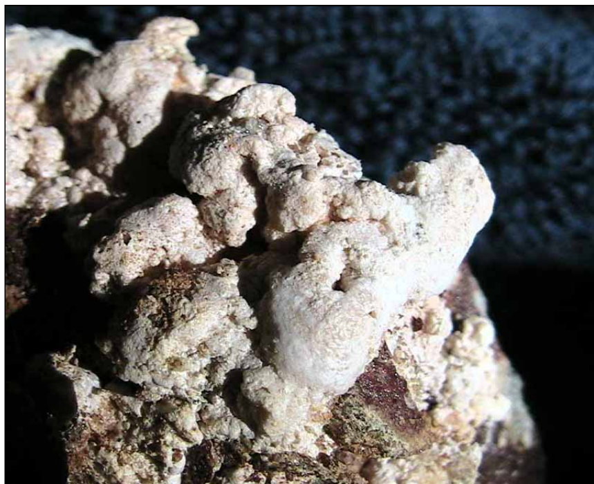
White, frosty, crusty, mineral from Beebe River bank. Photo view field about 1.5 inch by 1 inch.

As a New Hampshire species collector, my most interesting find was several pieces of a white, frosty, crusty mineral on the protected underside of a large sulfide boulder. I thought this might be Pickeringite. Although this is not a particularly exciting mineral, as far as aesthetics go, I am not aware of any previous reportings of this species in New Hampshire.