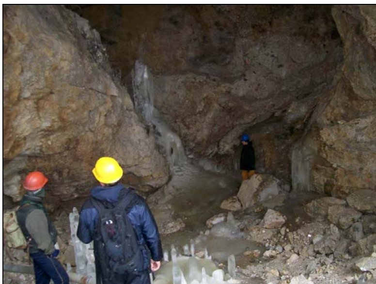
Traditional Winter Fieldtrip to Palermo n°1 pegmatite, NH.

Please be sure to wear appropriate clothing: hardhat , sturdy boots (preferably steel toe), safety glasses and work gloves .